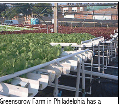
hydroponic lettuce operation in a former abandoned lot.

Currently the site consists of a 6000-ft<sup>2</sup> heated greenhouse; three raised beds