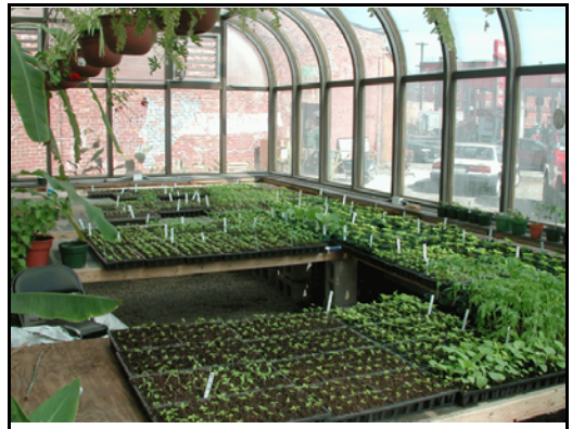
Small greenhouse attached to commercial kitchen and office space in downtown Holyoke, Massachusetts.

UCLA Pollution Prevention Education and Research Center. 1997. Homeward Bound: Food Related Transportation Strategies in Low Income and Transit Dependent Communities. Pollution Prevention Education and Research Center. University of California – Los Angeles. Available through the Community Food Security Coalition, P.O. Box 209, Venice CA 90294. http://www.foodsecurity.org.