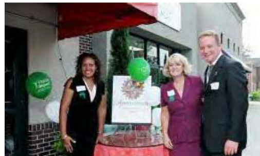
The motto of the Tallahassee-based nonprofit is: “Mobilizing communities against hunger & poverty”

R eligious organizations have been a leading catalyst for social justice in the South for more than 200 years, so their work in food policy councils that bring food to the poor is a natural fit. Florida Impact is one such interfaith organization that since 1979 has wracked up a record of one successful