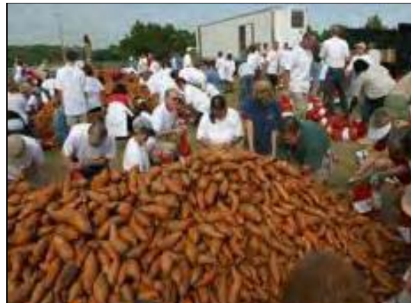
Volunteers with the North Carolina Gleaning Project bag 40,000 pounds of sweet potatoes as part of National Hunger Awareness Day observances in June, 2004. More than 900,000 people in the state experience chronic hunger each year.

Examples of the food security programs operated by the North Carolina Department of Agriculture and Consumer Services include: