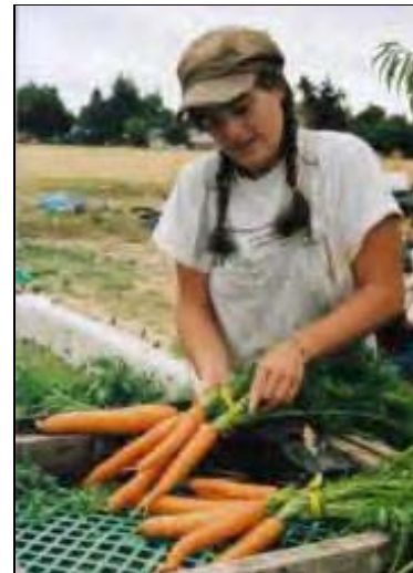
A worker in the Lane County Community Gardens bundles some carrots for the anti-hunger food program.

H eading up northwest, we'll see that not all food policy councils are operated in direct partnership with local or state governments. The Lane County Food Policy Council at Eugene/Springfield, OR, is the offspring of two nonprofit organizations, a local college and a network of six community action groups. Now in the final formation stage, the fledgling FPC has set an ambitious agenda to address what are some of the highest statewide rates of hunger and unemployment in the U.S.