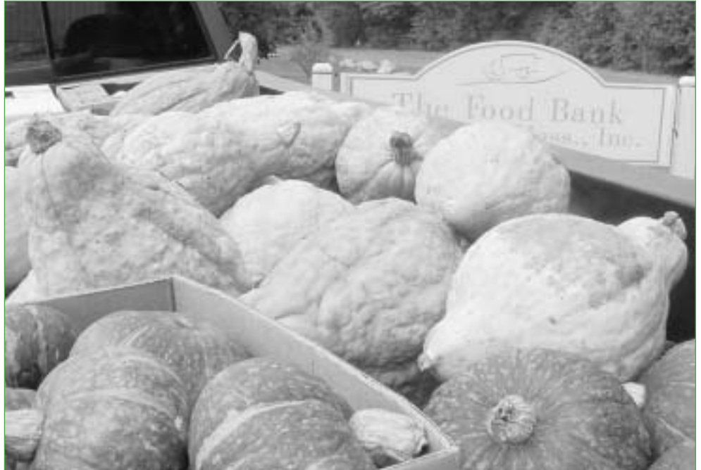
Squash harvested from Western Massachusetts Food Bank's farm.