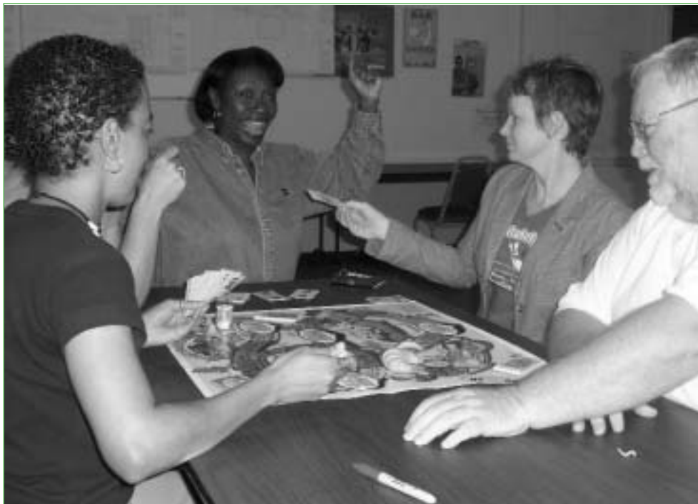
Atlanta participants play Feast or Famine, the Hunger 101 Board game.