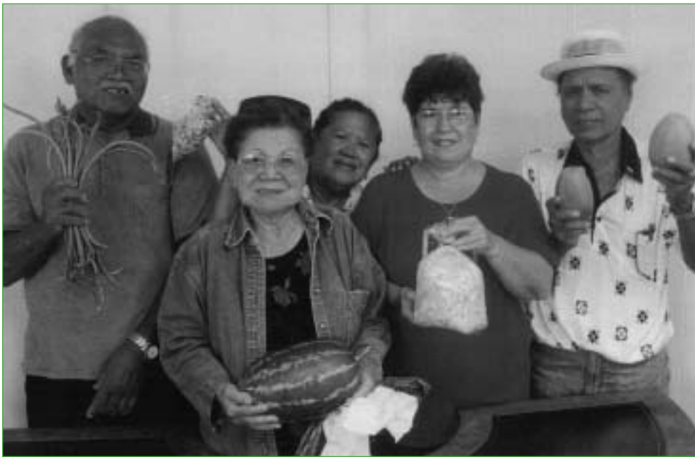
Kauai Seniors Showing Their Produce Selections

Ending hunger through economic development and ensuring that the island can survive catastrophes are not the only goals of Kauai Fresh . It also is a health promotion strategy. Native Hawaiians, like many indigenous peoples, have proven to be very susceptible to diabetes. With an average diet comprised of 50% calories from fat, and with 90% of their food imported and very costly, increasing availability of produce through supporting local farming is a linchpin of any nutrition education strategy on the island.