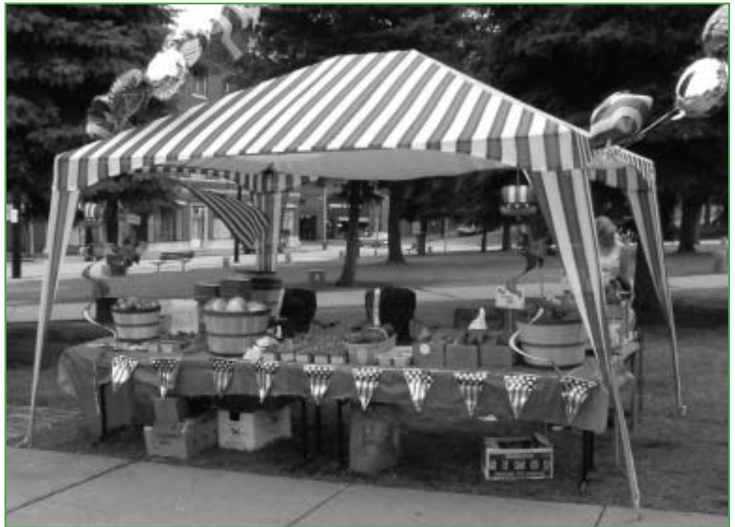
A farmstand associated with the Greater Pittsburgh Community Food Bank.

It is clear that food banks play a vital role in meeting the immediate food needs of millions of hungry people. Yet their role in addressing longer-term food security issues is less clear and sometimes a focus of controversy. Some argue that food relief is a crucial part of moving people toward greater food security, and that any food is better than none for a hungry person. Others contend that food banks foster dependence on food industry cast-offs, many of which have little nutritional value, and that they fail to create lasting solutions to hunger