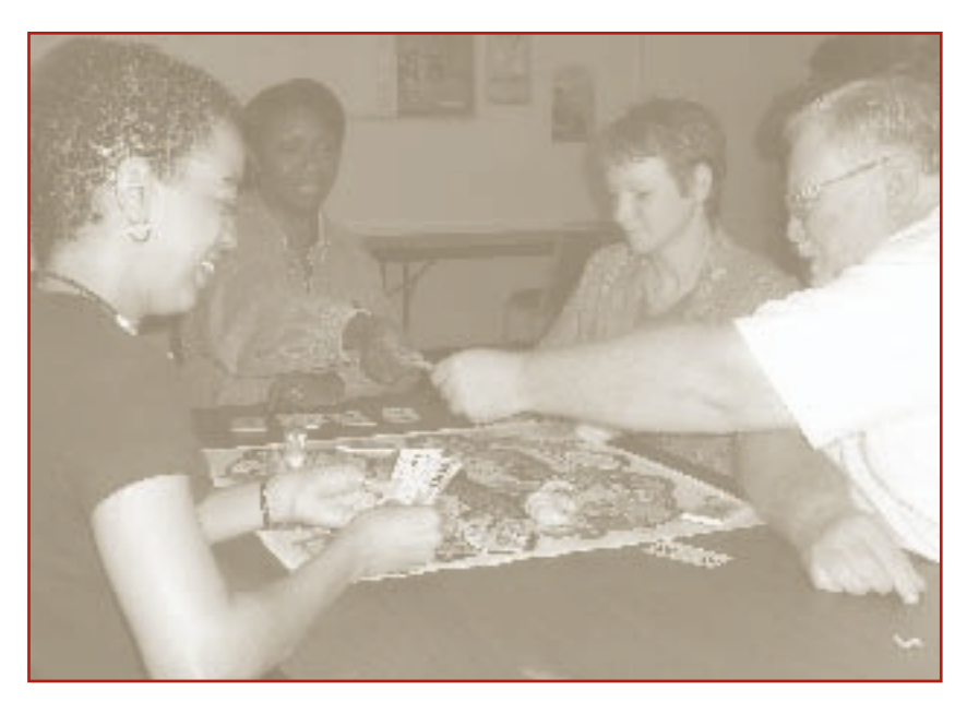
Hunger 101 participants play Feast or Famine Board game

Such a dramatic shift needs resources, information, and leadership. A partnership between the food banking community, the community food security movement, funders, and legislators will be necessary. The following are recommendations to make this expansion a reality: