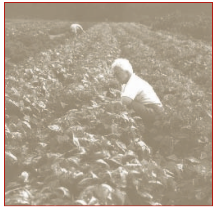
Harvest Time at the Western Massachusetts Food Bank Farm

The farm is an example of a program that is economically self-sufficient which adds one slice to the community food security in the region. The farm also engages shareholders into The Food Bank as a whole, creating a natural constituency. For example, when The Food Bank put out an emergency alert for the need for food drives this fall, farm shareholders brought in over 2,000 pounds of peanut butter, soup and other non-perishable meals. While shareholders often see their farm share check as their monetary donation to The Food Bank and do not necessarily contribute more, the farm does create awareness of hunger and of the role and mission of the entire organization.