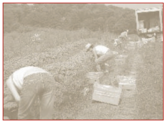
Harvesting kale at a local farm for the Pittsburgh Food Bank